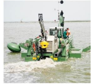
YOU NEED TO CRUISE IN WATER TO REACH THE SITE