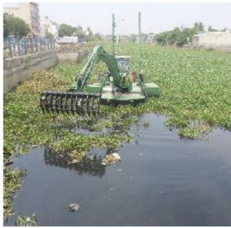
EXCAVATING, RAKING, PILING IN 0-6 M DEPTH