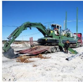
THE EASE AND SPEED OF TRANSPORTATION IS IMPORTANT