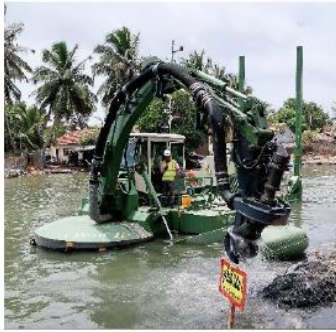
SUCTION DREDGING IN 0-6 M DEPTH

500 million dollars offer to Purchase Rights of Plum Island as part of Endowment Pledge Accepting all current conditions of same to restore potential as a SAFE Place of Public Service Formed to honor our Heritage, History & Future we have received the gift of a masterful amphibious machine and a 5 year pledge for staff that will assure the Love & Care from all corners of the Sound. State & Federal & Educational Sites will know their efforts will be aided from start to forever by the income from a firmly set to protect fund of 500 million dollars. Not relying on the vicissitudes of politics or the vulnerability of Annual Fund Raising we will make our Ancestors & Future Generations feel our treasures are protected & enhanced & revitalized & improved by Love & Care. FEDERAL GOVERNMENT ASSETS WILL REMAIN IN PLACE